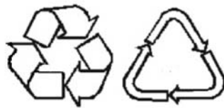
Figure 1 For food products